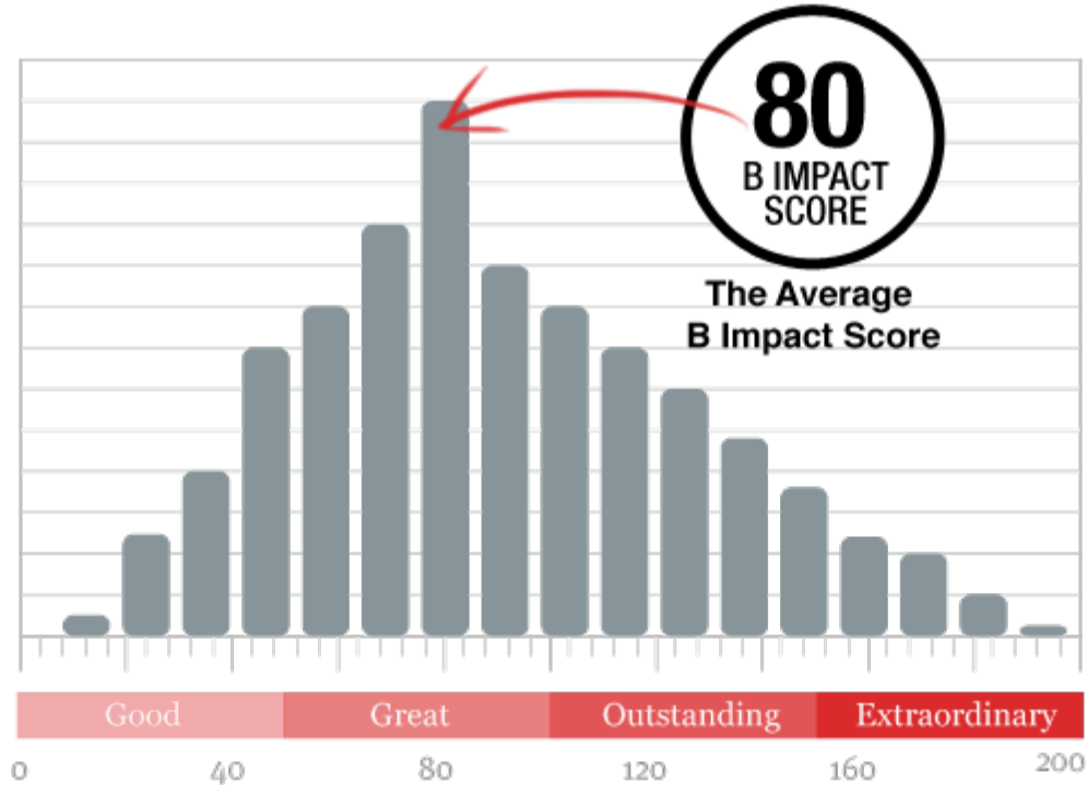
Figure 1. What is considered a "good" score?